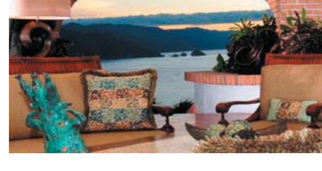
Visit us online at www.villasdeoro.com Villas de Oro Copyright © 2005 All Rights Reserved