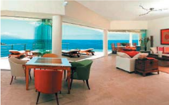
Casa La Vista Puerto Vallarta