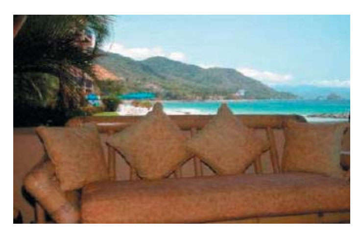
Visit us online at www.villasdeoro.com Villas de Oro Copywright © 2005 All Rights Reserved

This ultimate beach casita located south of the city next to the luxurious, Los Palmares complex. Villa Karaway is part of the Los Palmares complex in Playa Punta Negra, which is 6 km (4 mi) south of town on highway 200. Los Palmares is made up of 31 private homes. This charming 4 bedroom, 4 1/2 bath villa consists of 5,000 sq.ft. of living space on two levels. Casa Karaway was professionally designed and decorated with your comfort in mind. Sit on the veranda or relax in your private infinity pool. The master bedroom is located on the second level and pampers you with luxury. Each bedroom has it's own bath plus there is a 1/2 bath off of the gourmet kitchen. All rooms are fully air-conditioned and your personal staff will pamper you beyond belief. Some of the amenities include cable TV, VCR, stereo, and Jacuzzi tub in master bath. Guests of Casa Karaway can also use facilities of the Los Palmares condos next door. You are welcome to use the facilities of Los Palmares which includes a large infinity pool, restaurant and exercise room. 24 hour security is also provided. Villa Karaway is unit 104 and shares some walls with Los Palmares and also stands out of the complex for the "private feel."