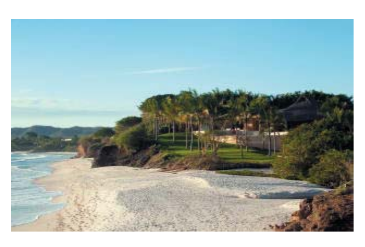
A premier estate, pristine beach, lush tropical landscaping, and elegant appointments complete the unique Casa Papelillos experience.