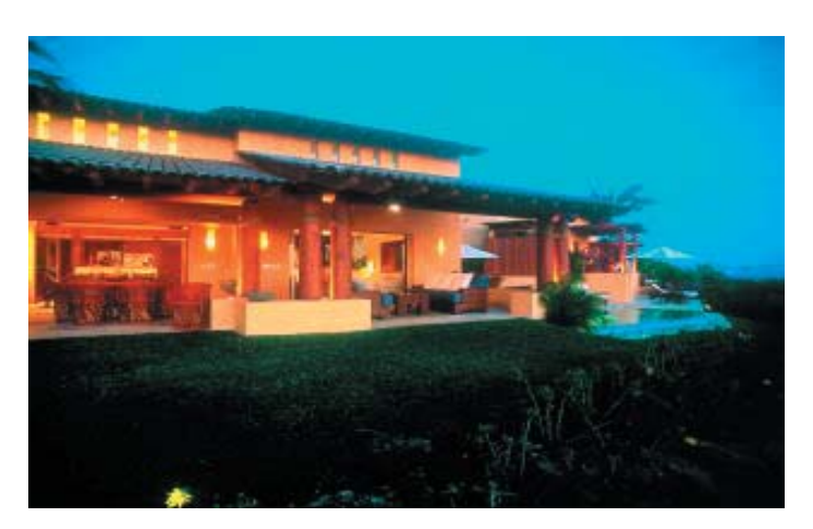
Visit us online at www.villasdeoro.com Villas de Oro Copywright © 2005 All Rights Reserved

Offering privacy, comfort and spectacular ocean views, the Five-Bedroom Private Hillside Villas are over 8,000 sq. ft., nestled into the hillside and surrounded by lush gardens. They combine Four Seasons quality and understated elegance with a coastal sensibility accented by the furnishings, art and flavor of contemporary Mexico. A unique rental opportunity available through the Four Seasons Resort, these individually owned homes are secluded in a private neighborhood only moments from the first tee of the Resort's own Jack Nicklaus signature golf course. They are supported by the amenities and personal service of Four Seasons Resort Punta Mita. Spacious living quarters with cathedral ceilings are complemented by a fully equipped gourmet kitchen, washer and dryer, multiple TV's, DVD and CD players.