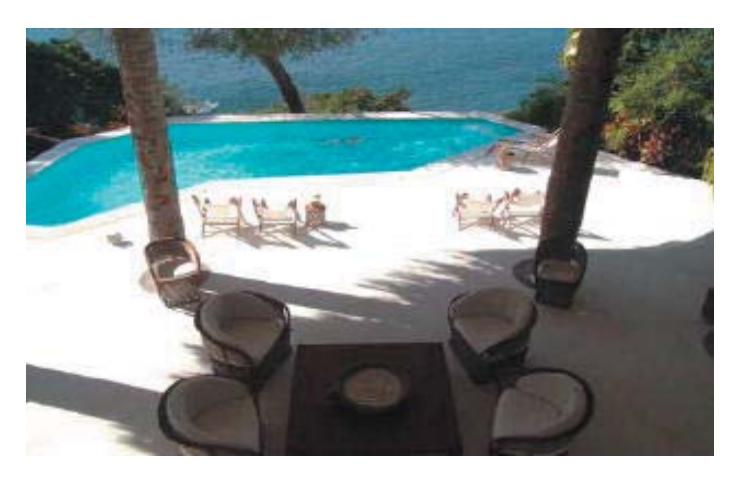
Visit us online at www.villasdeoro.com Villas de Oro Copywright © 2005 All Rights Reserved

This Mediterranean style villa is located in the very exclusive resort area of Ixtapa/Zihuatanejo. It was designed by a very famous Mexican architect, Diego Villasenor, who is recognized by Architectural Digest magazine as one of the best 100 Architects in the world. This beautiful villa is approximately 9,000 sq. ft. and boasts of a large living and dining area and four large bedroom suites with private bathrooms and terraces and magnificent views of the Pacific Ocean and incredible sunsets. This villa with it's fabulous open spaces and teraces offer an incredible sense of freedom. Some of the amenities include TV, Stereo, High Speed Internet, van with driver. Casa del Sol's friendly staff is responsible for making your stay happen in the most pleasant way. They have earned this exceptional reputation. Ixtapa/Zihuatanejo is one of the most exclusive and unique locations on the coast of Mexico. Due to the combination of the quaint old Mexican fishing village of Zihuatanejo and the contemporary comfort of the modern resort town of Ixtapa it is now being refered to as the "New Mexican Riviera". The resort area of Ixtapa / Zihuatanejo is approximately 125 miles north of Acapulco, Mexico.